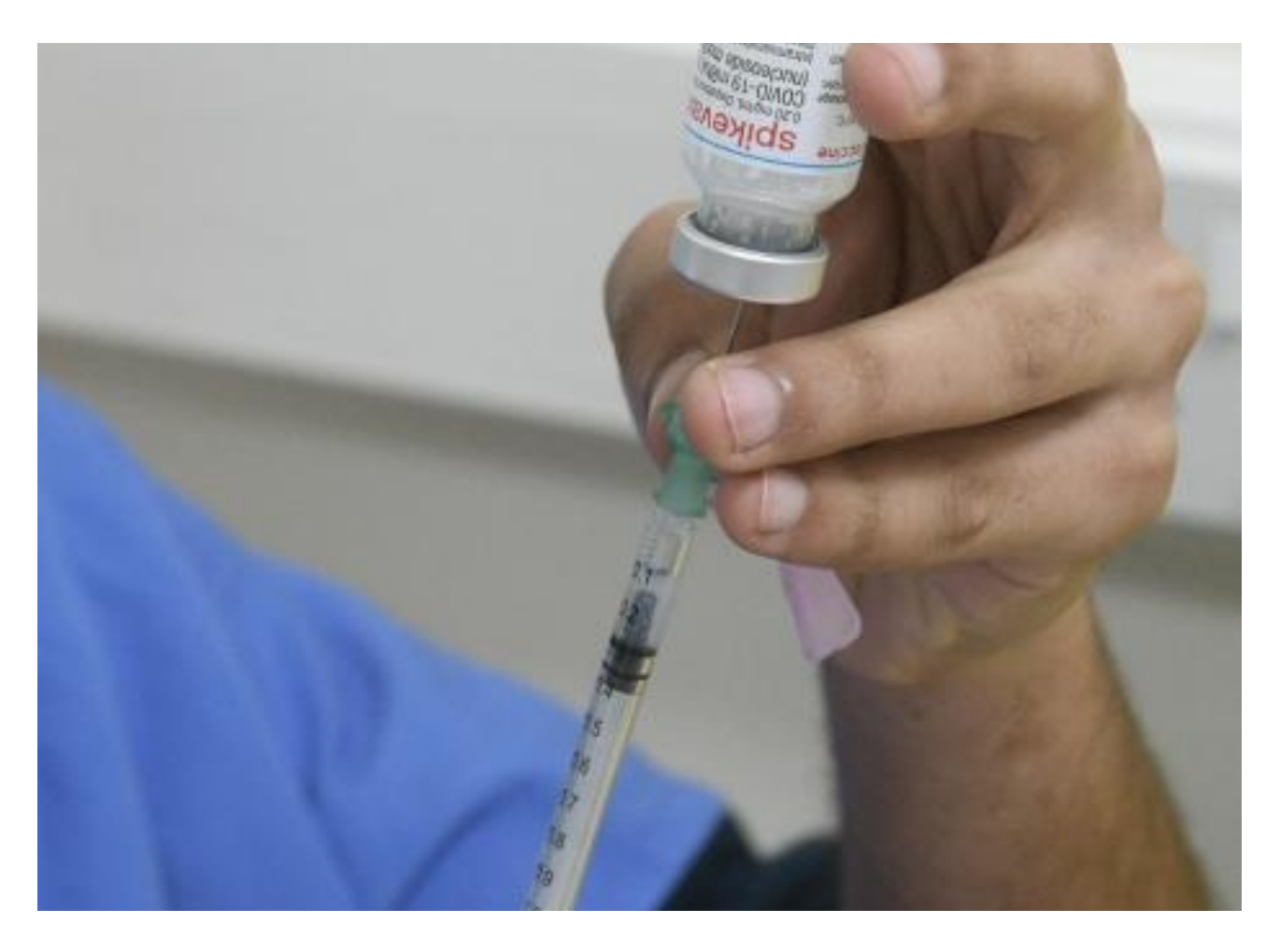
The vaccination hub (Covid-19) at the University of Malta., 27/01/2022

Pandemic and infodemic: parallel waves? The European Digital Media Observatory has been publishing monthly briefs about disinformation in the EU since July 2021, and have now analyzed all the published briefs looking for patterns that emerge over the the past seven months, to understand what we can expect for the coming future. More.